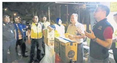
▲官员巡视时发现 3 个藏有孳子的花瓶。