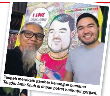
Taueh merakam gambar kenangan bersama Tengku Amir Shah di depan potret karikatur gergasi.

apabila pegawai sulitnya memberitahu baginda ingin menjamah santapan malam di kafenyanya yang terletak di Parit 3 Timur, Sungai Besar. Ujarnya, dia membuat persi-