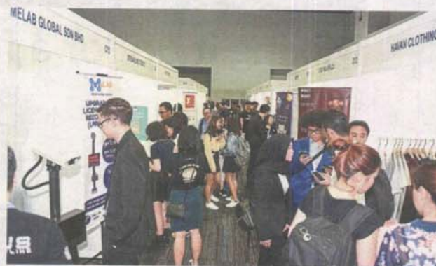
Visitors checking out booths by exhibitors from the digital economy ecosystem at the convention.

In his opening speech titled "Selangor: Southeast Asia's Premier Smart State by 2025", Amirudin said: "I can tell you in confi-