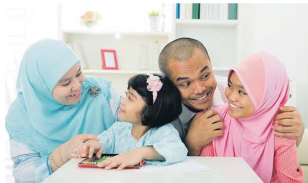
SEORANG suami dan bapa bertanggungjawab memberi nafkah terhadap isteri dan anak masing-masing.

Selain itu, pihak pemerintah juga boleh memainkan peranan dan memastikan tanggungan nafkah anak-anak yang ketiadaan bapa dan ahli waris dibiayai oleh baitulmal yang mana ia merupakan tempat terakhir untuk