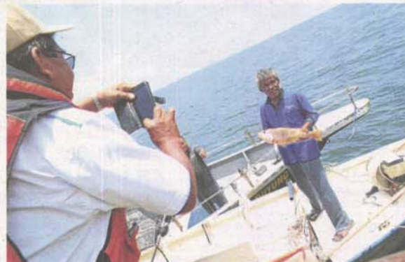
A fisherman posing for a picture after catching a red snapper during the reef operation. His peers in Kuala Langat and Sepang are counting on the artificial reefs to increase fish stock.