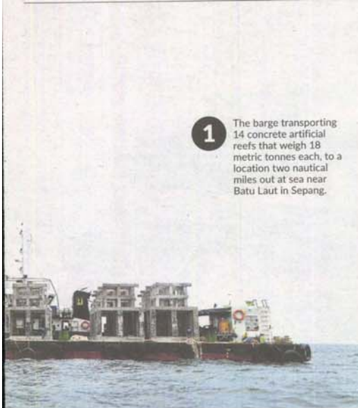
1 The barge transporting 14 concrete artificial reefs that weigh 18 metric tonnes each, to a location two nautical miles out at sea near Batu Laut in Sepang.

Provided for client's internal research purposes only. May not be further copied, distributed, sold or published in any form without the prior consent of the copyright owner.