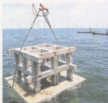
3 A block of artificial reef being submerged in the sea.