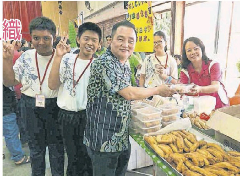
■ 忘购买食物以支持义卖筹款。 黄瑞林（左3）参观育群华小的嘉年华档口时，不

黄瑞林也是适耕庄州议员。他强调，雪州政府每年制度化拨款华教，如今加上中央政府各部门辅助，各种拨款源源不绝，因此希望朝野政党，不要为了自身政党利益而把教育问题政治化。