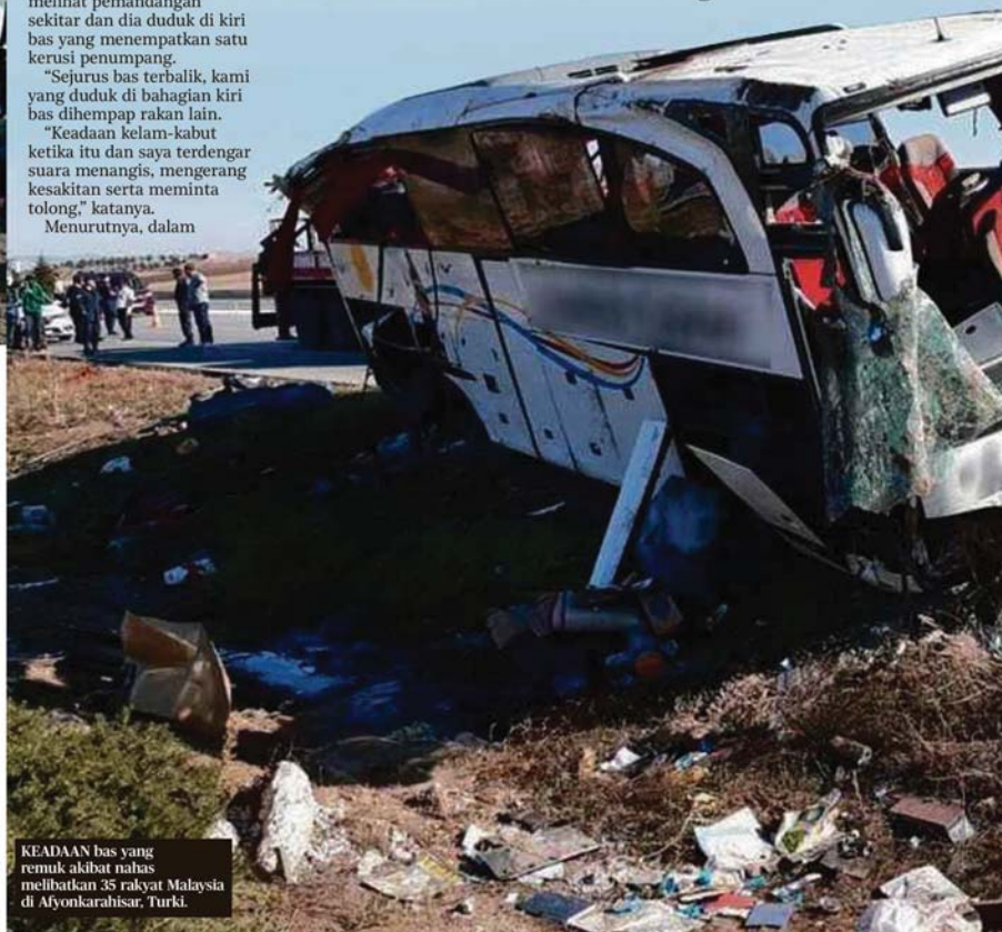
KEADAAN bas yang remuk akibat nahas melibatkan 35 rakyat Malaysia di Afyonkarahisar, Turki.

Seorang terbunuh, 4 kakitangan PKNS parah dalam nahas ketika makan angin di Turki