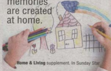
Home & Living supplement. In Sunday Star

According to Dashedalinni, the artificial reefs are submerged at a depth of 34m in slack water conditions, which is ideal for attracting demersal fish that will not venture into waters less than five metres deep.