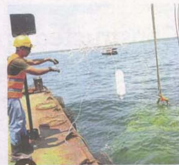
4 A worker throws a buoy which has been attached to the reef to mark its location.