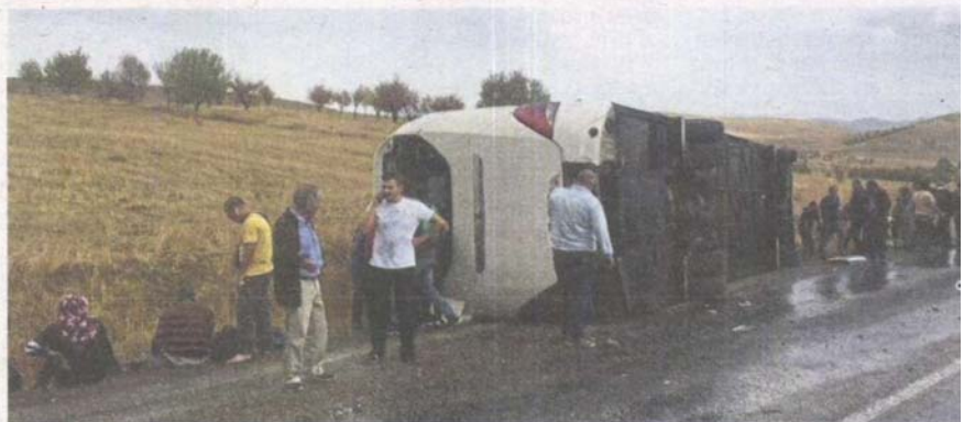
Tragic end: The tour bus lying on its side after the crash that killed one and injured 10 others.

"We were sent to different hospitals," he added.