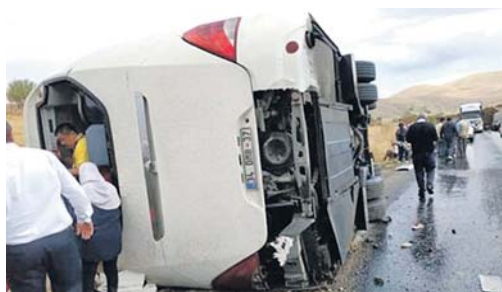
Keadaan bas yang terbalik akibat nahas di Afyonkarahisar, Turki kelmarin.