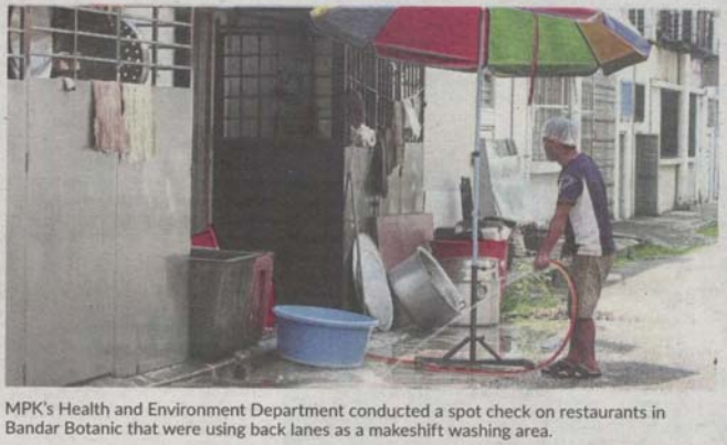
MPK's Health and Environment Department conducted a spot check on restaurants in Bandar Botanic that were using back lanes as a makeshift washing area.