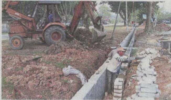
Residents say the drains being built along Jalan Selampit 29 and Jalan Seruling 26 in Taman Klang Jaya are not up to mark.

"Right beside the drain is a soil path with grass, trees and so on. Constructing the drain at the same level was a bad idea because all the soil and dirt would end up being washed into the drain.