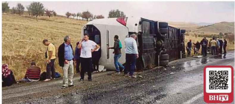
Kemalangan bas yang membawa 35 rakyat Malaysia terbabit nahas menyebabkan seorang rakyat Malaysia terkorban, empat parah dan 17 cedera ringan di Afyonkarahisar kelmarin.