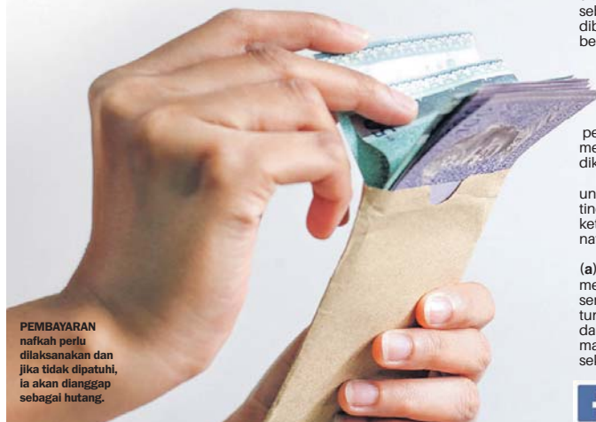
PEMBAYARAN nafkah perlu dilaksanakan dan jika tidak dipatuhi, ia akan dianggap sebagai hutang.

Tanpa adanya laporan atau aduan, pihak yang bertanggungjawab tidak dapat memulakan tindakan terhadap bapa atau suami atau 'orang yang bertanggungjawab' yang mengabaikan perintah nafkah.