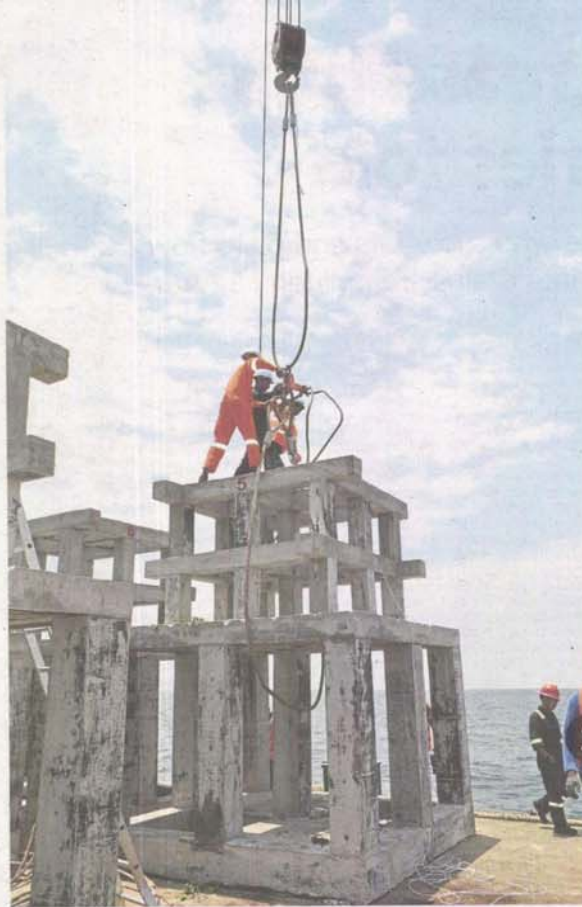
2 Contractors fastening metal cables to an artificial concrete reef. These reefs are designed by Selangor Fisheries Department's engineers for soft seabed.

He said that once Fisheries Department had ascertained that a fish breeding ecosystem was thriving on the artificial reefs, the state might consider allocations for fish aggregating devices to the area as well to enhance existing results.